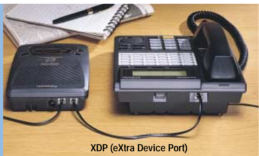
XDP (eXtra Device Port)