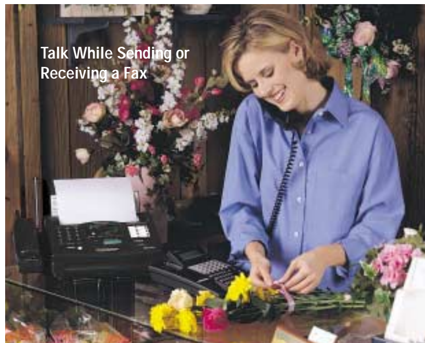
Talk While Sending or Receiving a Fax